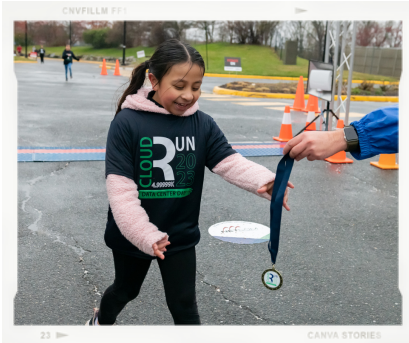
1 MILE FUN RUN